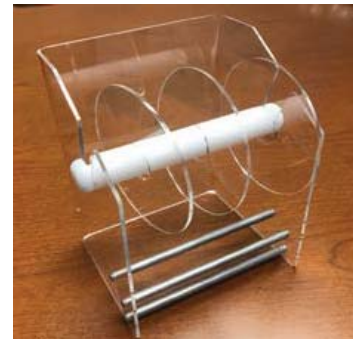
RX999 - HOLDS 3 ROLLS

CUSTOM LABELS ARE AVAILABLE W/$35 ART CHARGE 12 ROLL MIN. = $25/ROLL 24 ROLLS = $20/ROLL