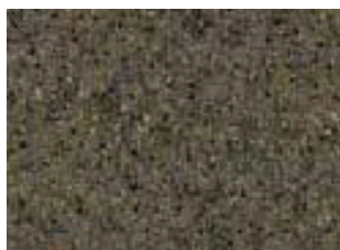
Maui Granite Dark Shade (raised edge will capture liquids)